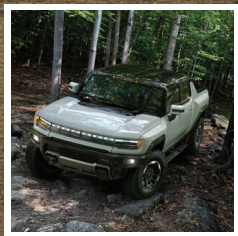
2025 GMC HUMMER EV