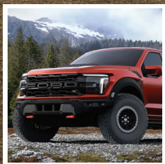
2025 FORD F-150 RAPTOR